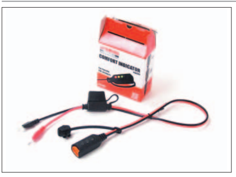
Article number: YME-YECPA-15-00