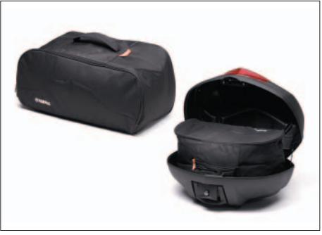
Article number: YME-BAG50-00-00