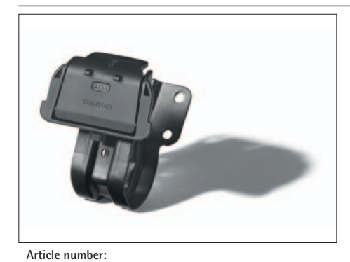
GPS Stay X-MAX