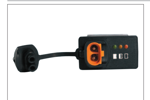
Article number: YME-YECIP-15-00