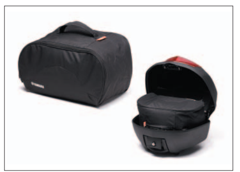
Article number: YME-BAG39-00-00