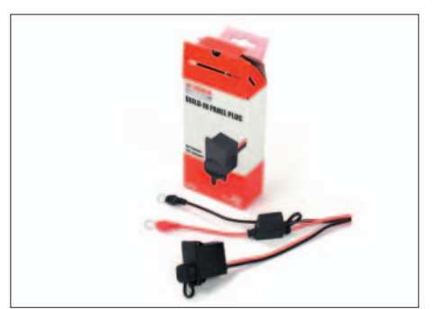
YEC Battery Charger Built-in Panel Plug

Smart and easy plug for connection from panel mount socket at the dashboard to the YEC-8 or YEC-40 battery chargers