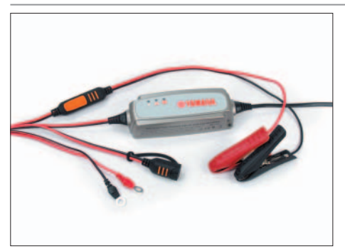
Article number: YME-YEC08-EU-00 EU-plug YME-YEC08-UK-00 UK-plug