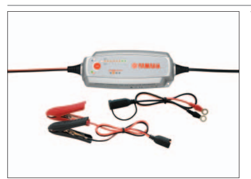
Article number: YME-YEC40-EU-00 EU-plug YME-YEC40-UK-00 UK-plug